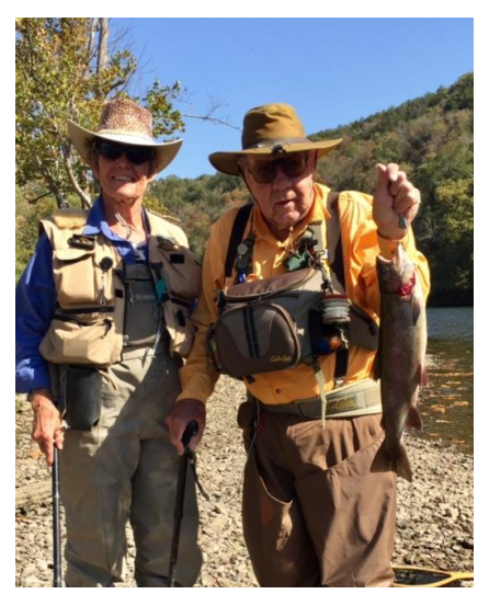
A sweet fish alongside his sweetheart