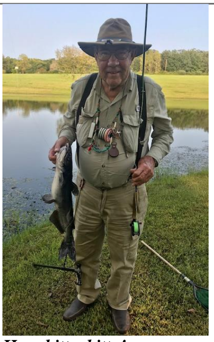
Here kitty, kitty!