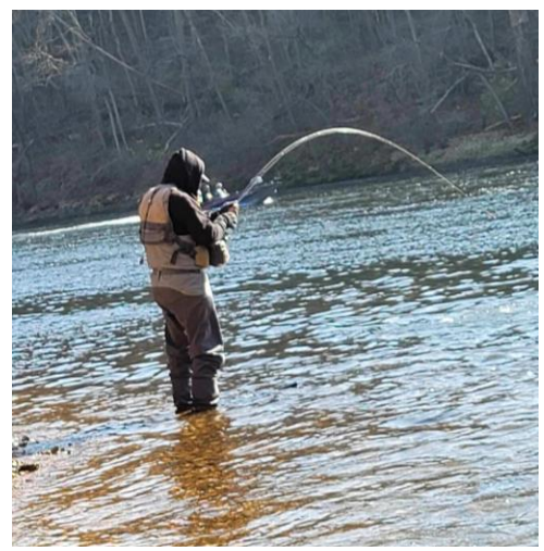
Bending Browns, like Beckham!