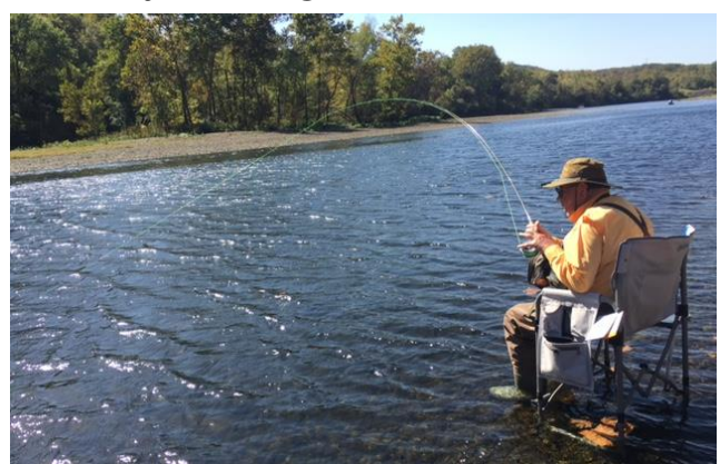
The new floating chair. Watch out Fish!