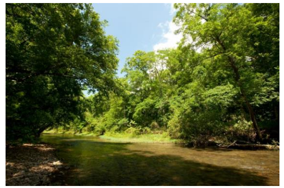
Here are some showing insects in action.

The Missouri Stream Team is proud to present a series of online presentations on the ecology, diversity, and conservation issues of Missouri streams.