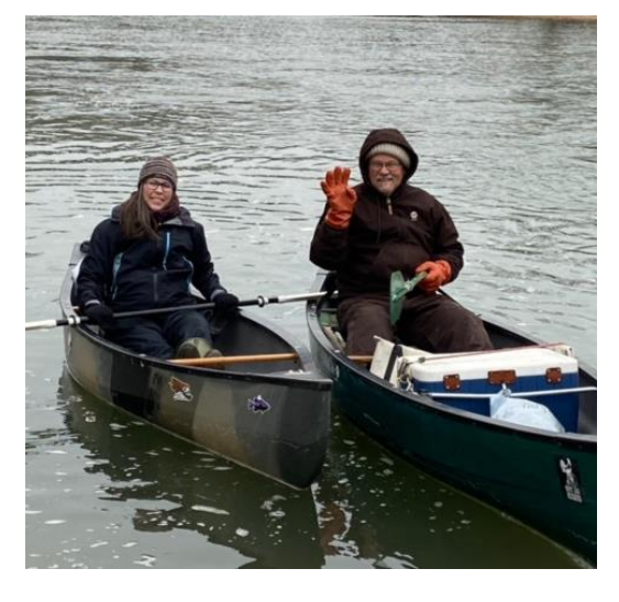
Froze, Froze, Froze your toes. Gently down the Stream.