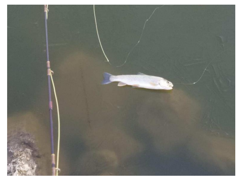
Mckay Park presents, "Bows on Ice"

How can we take advantage of this? I have been presented a couple of possibilities by club members. Both options will require some level of active participation from club members, so we will need to discuss their viability for us. The next article will talk about the options.