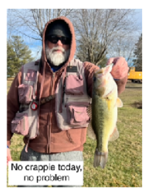
At the Fly Fishing Festival can see world class anglers in fresh and salt water. It will be at the Ragtag in Columbia starting at 10:30 January 27th. Doors open at 10, so you can get a good seat. <u>Get your tickets here</u>.