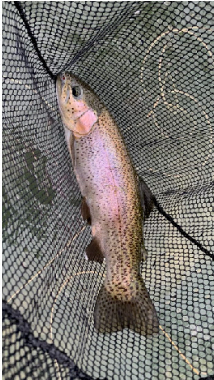
Phil's big, colorful McKay bow