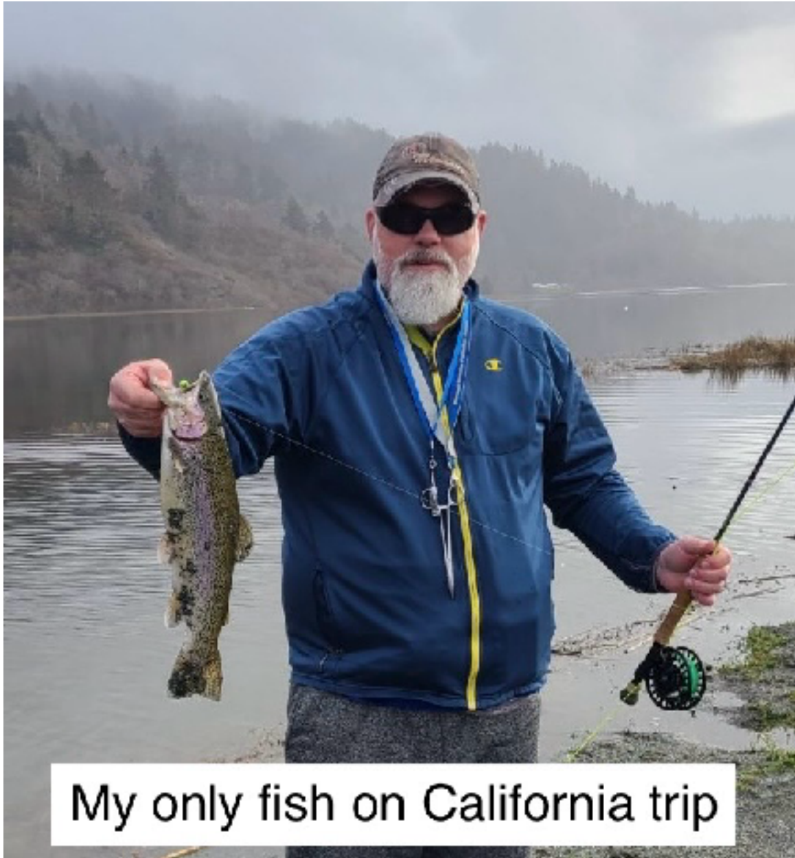
My only fish on California trip