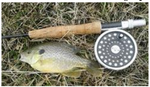
Caught using red ant tied at a session