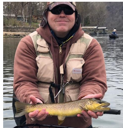
19" Brown caught on White River 2/23/18

Anybody else catching any fish out there? Don't be afraid to share your successes. I hope to see more photos with the anticipation that the weather will break. Big fish, small fish, old or new photos, funny fishing photos, or something interesting photos are all appreciated.