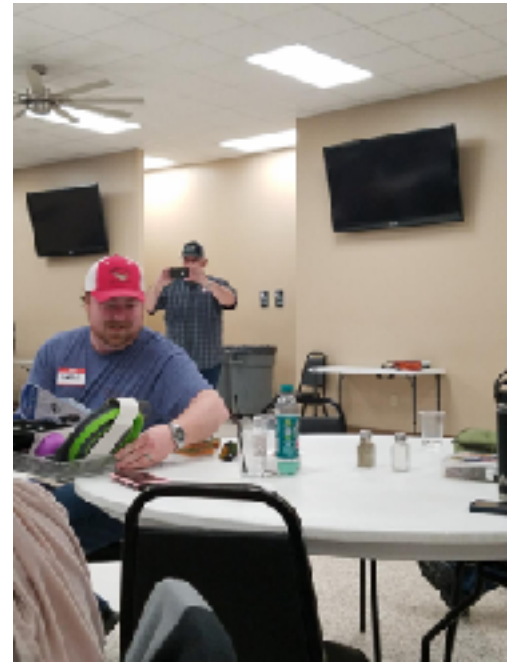
Master Fly Tier at Tri-Lakes