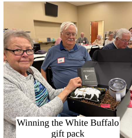
Winning the White Buffalo gift pack