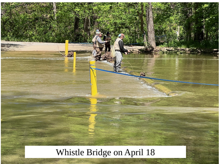
Whistle Bridge on April 18

Please share your fly fishing stories, photos, events, and/or gear by submitting something to the newsletter.