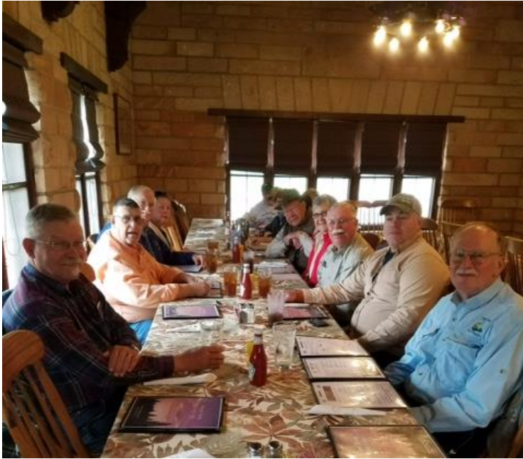
Photo at Bennett Spring Lodge