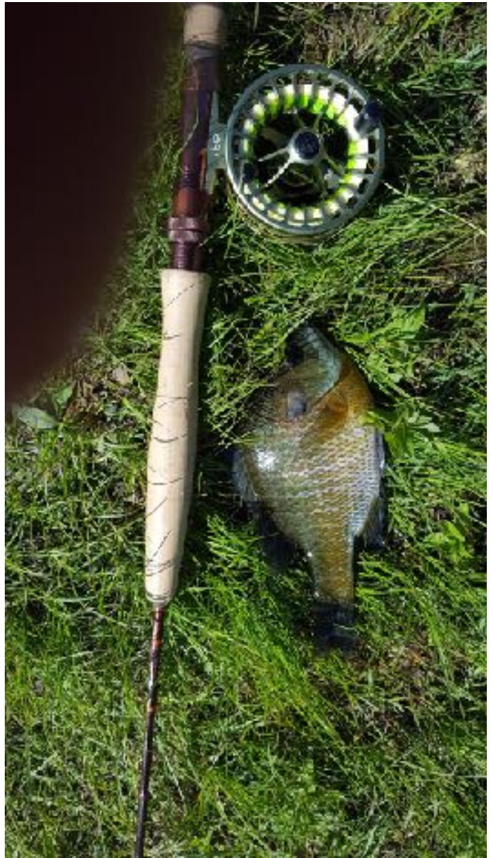
John's 1 wt Redear on beds at Binder/Bennett Bow