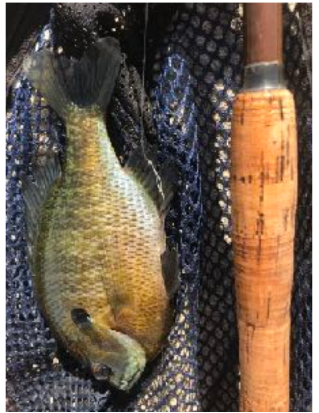
Phil's first visit to Roaring River - STRETCH!