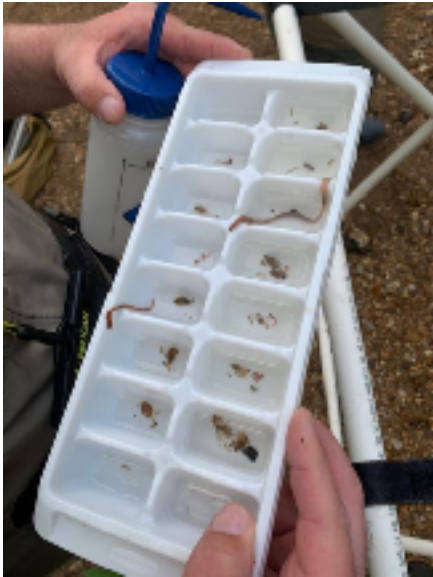
Above is what they found Right: Measuring stream discharge