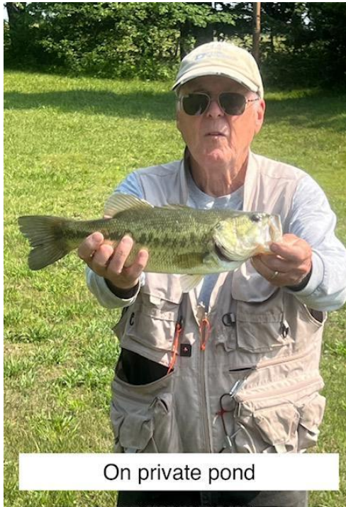
On private pond