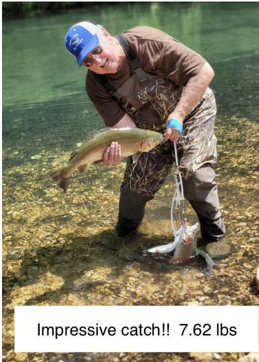
Impressive catch!! 7.62 lbs