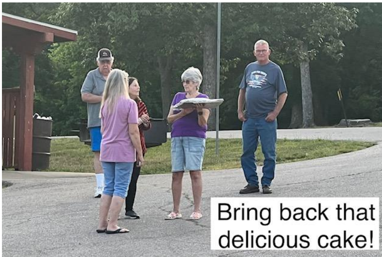
Bring back that delicious cake!