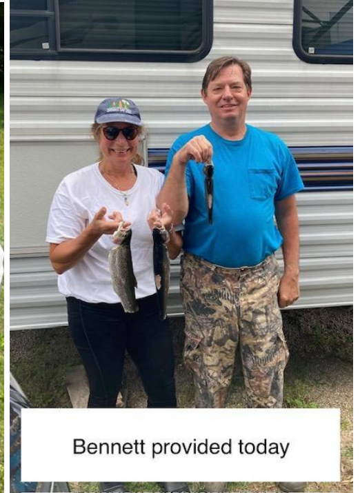
Bennett provided today