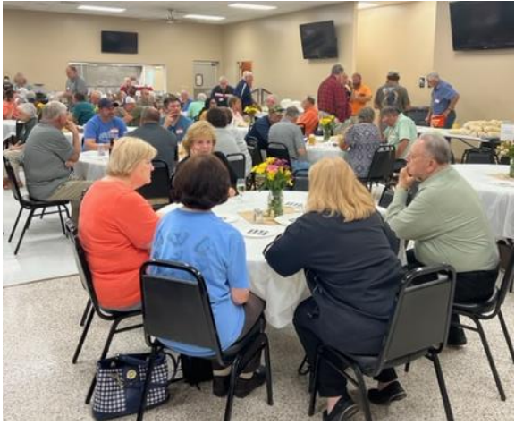
Left: We've got a pretty good crowd