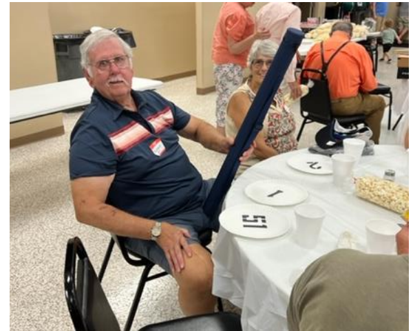
Right: You bet I did! I've got a new rod.