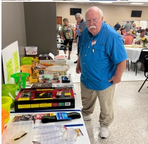
Left: Oh my! Did you see all these great items?