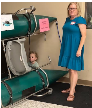
Left: Check out my new ride!!!