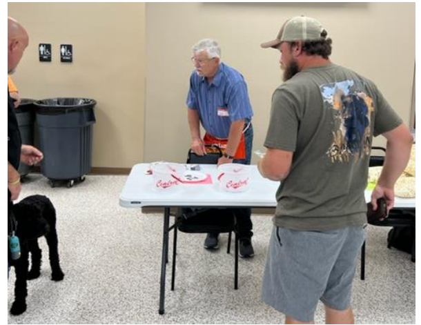
Right: Tickets! Get your tickets here!