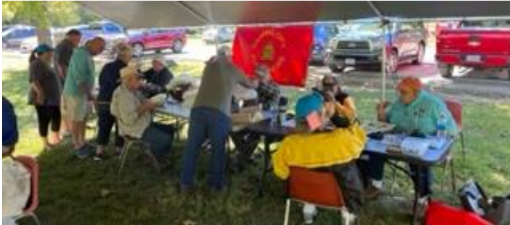
Getting ready to tie flies at Ladies Fishing Day