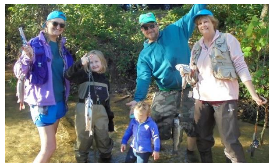
Ladies Fishing Day is multi-generational

We would love to see you there. Invite a friend or two. $20 will get you a great meal and some entertainment for the evening.