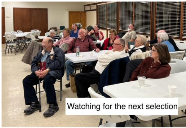
Watching for the next selection