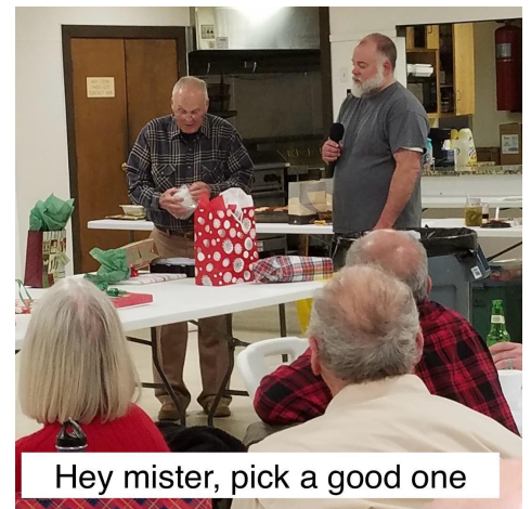
Hey mister, pick a good one