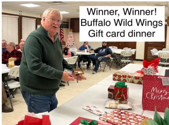
Winner, Winner! Buffalo Wild Wings Gift card dinner