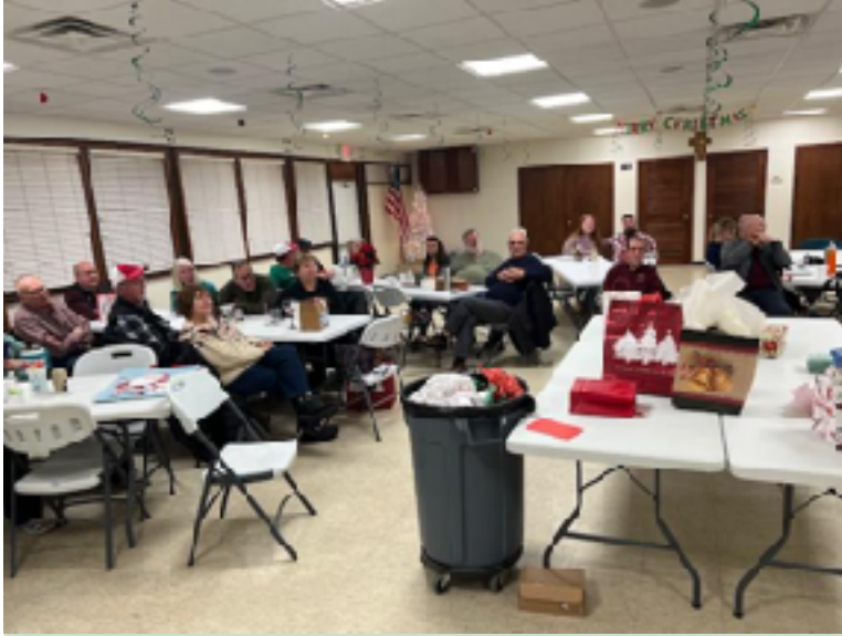
Our annual Christmas party was another success. We had great attendance, good food and lots of gift stealing.